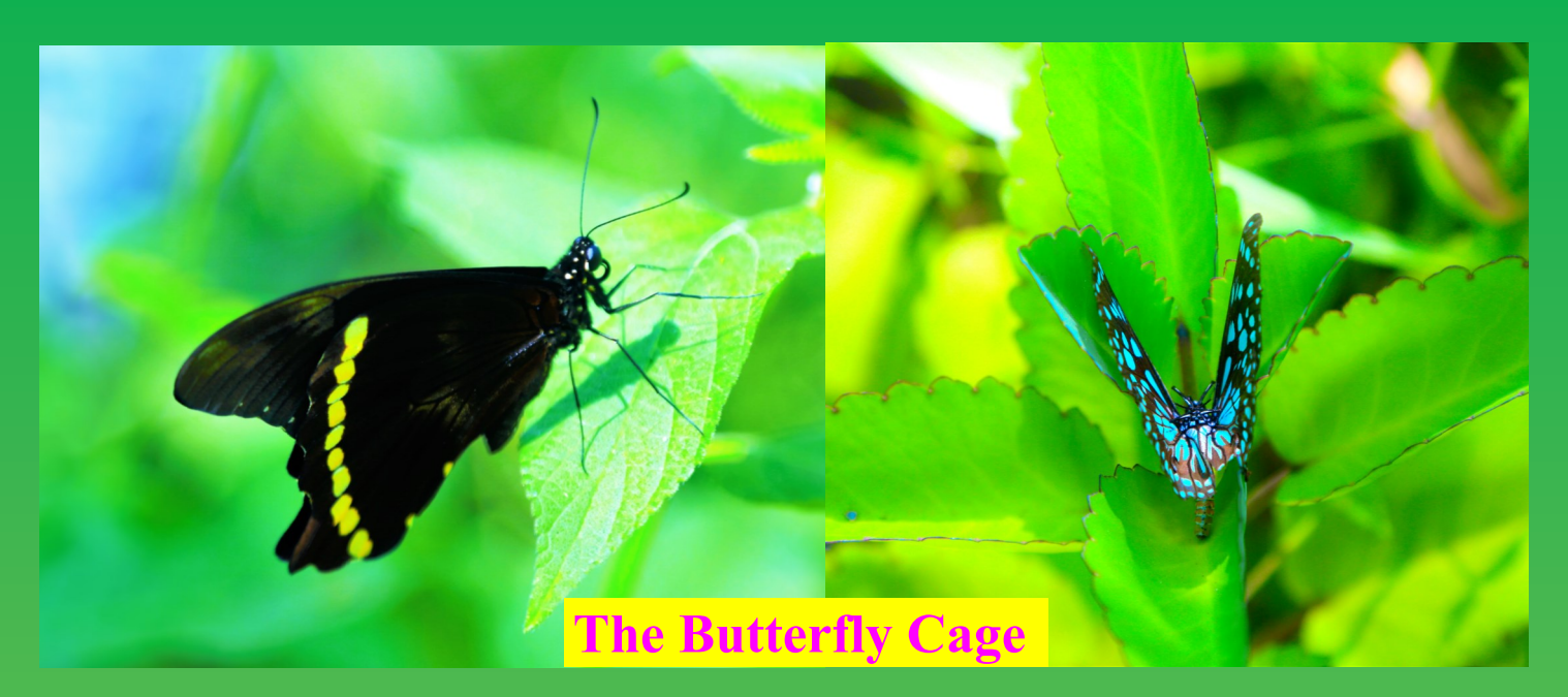
The Shimba Hills Ecosystem is a habitat of around 71 Butterfly Species. Observing these attractive insects during their stages of development from Egg, lava, Pupa to a fully grown butterfly is an interesting Possibility.