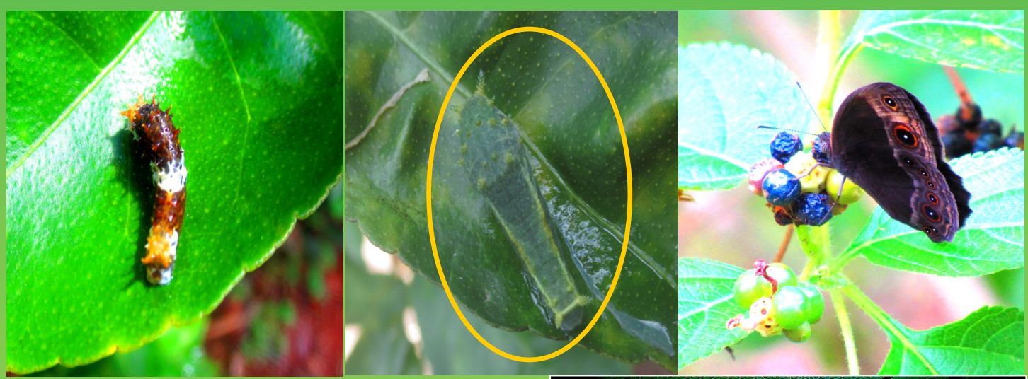
SHIFOGA Offers you an opportunity to observe all these stages of butterfly development at a closer range. A butterfly cage designed to offer Natural environmental habitats at a minimal proximity.